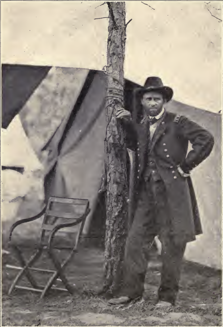
LIEUTENANT-GENERAL U. S. GRANT

Photo Presented to General Dodge at City Point, October, 1864